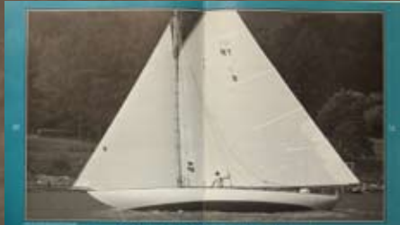
22 nd ANNUAL CLASSIC YACHT REGATTA August 31 st - September 2, 2011 The Museum of Yachting • Fort Adams State Park • Newport, Rhode Island